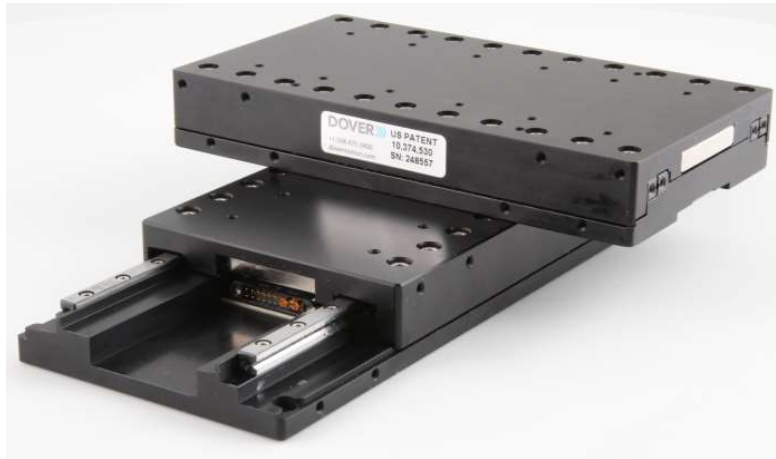
Figure 3: SmartStage XY with TOP built-in

Note that there is a division of labor required to produce the precise triggers required for TDI-CCD scanning imaging. The job of the Dover Encoder is to provide digital quadrature signals at just the right resolution to eliminate any image smear during the scan. Once the user measures a known artifact to determine the precise optical magnification for a given production instrument, our spreadsheet calculates the optimum resolution to eliminate any accumulating residual during the scan and downloads this new custom resolution to the Dover Encoder using a dedicated cable. This value is stored there in non-volatile memory, although it can be updated whenever needed by downloading a new resolution value. Once the Dover Encoder is programmed with its custom resolution, its job is done. The job of using the encoder signals to generate triggers on position at a specific spacing then falls to the motion controller. Both the standalone Dover Motion Controller Module (DMCM), and our new line of SmartStage™ linear positioners, with their built-in encoder interpolator and motion controller, are capable of generating precisely spaced triggers by performing divide-by-n processing of the incoming quadrature encoder signals.