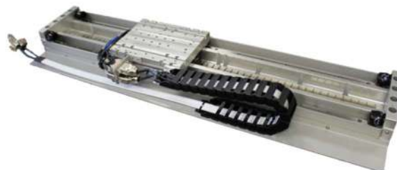
Figure 1: Linear Motor Stage

It is helpful to consider where the numerical requirements originated; the travel and moving mass are usually directly tied to the application, although any efforts to reduce them will be richly rewarded. The desired move time can be harder to pin down, but is often linked to some tie-in to units/hour, throughput, and economic justifications. The velocity limit is usually set by one of three factors; the linear encoder; the physical limits of the guideway bearings; or the available amplifier supply voltage.